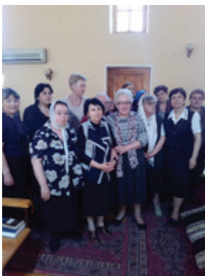
Widows Grace Baptist Church