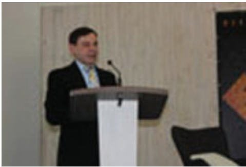
Presenting the New Testament in the city of Kremenchuk