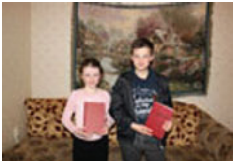
The new translation is going to change the lives of this boy and girl