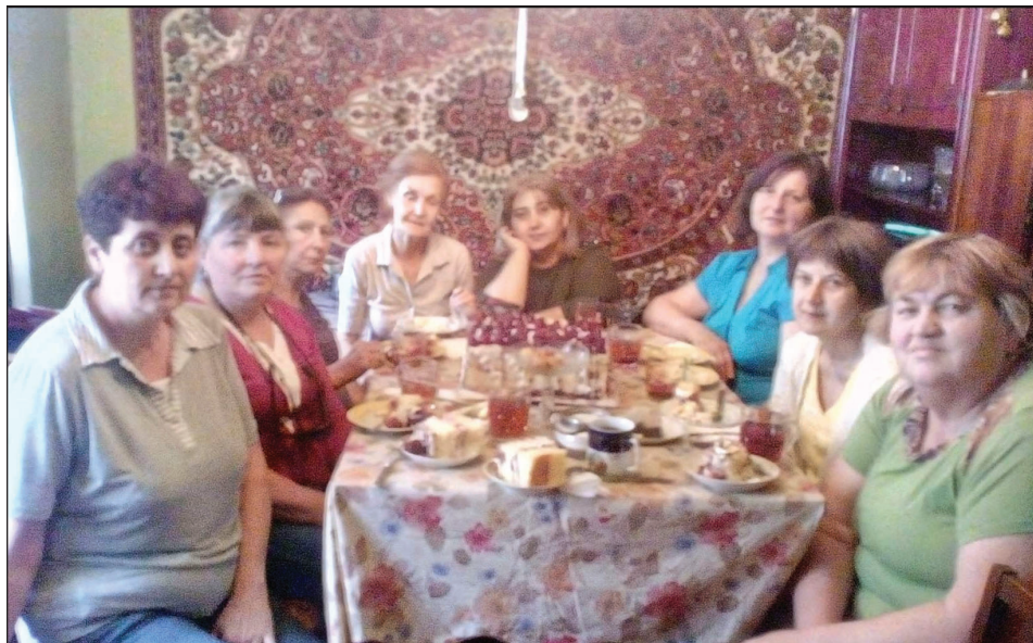
Ladies group in Ukraine gathering for fellowship.

Rest in peace until we meet again in the presence of the Lord, dear Margo!