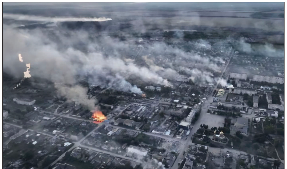
Ukrainian/Russian continues to take a devastating toll in Ukraine.